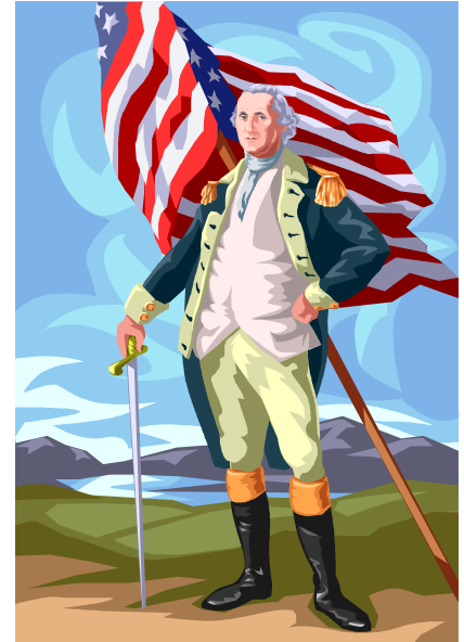
Washington's Birthday – February 22